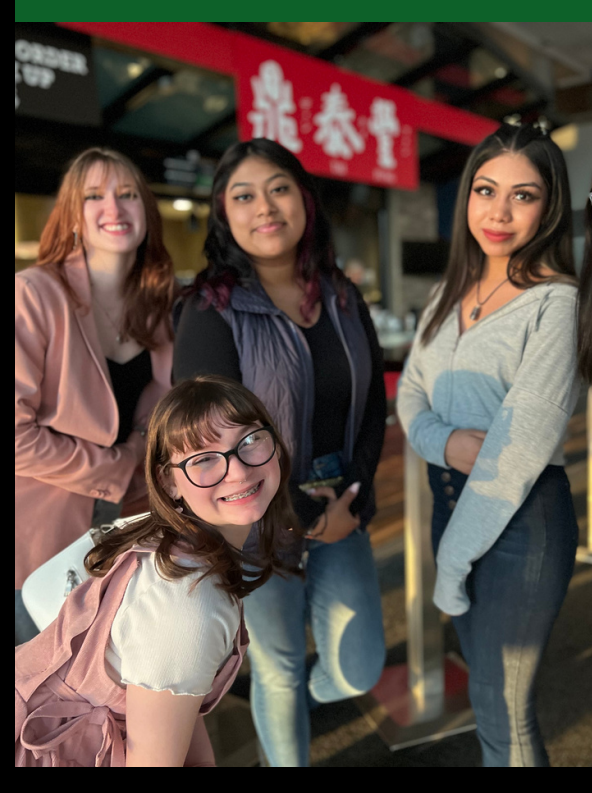
Above: WA World Fellow students gather for the 2022 Programs Celebration at Lumen Field in Seattle, WA.